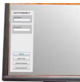
4 A PROVEN, RELIABLE SYSTEMS INTEGRATOR.