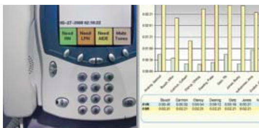
1 TRUE VOIP INTEGRATION.

Responder 5 can meet your needs, for today and tomorrow. Designed to fit existing systems, yet adapt as needs change or demand grows; its features and functions expand to address future needs and requirements. Because the system is scalable, it’s the right solution for a unit, a single facility, or an entire hospital network.