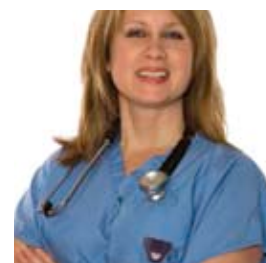
3 AUDIO IN THE BATH STATION.